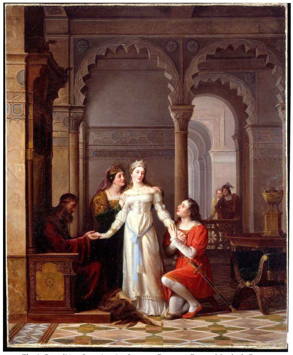
Fig. 2. Peau d'Ane. Jean-Antoine Laurent. Bourg-en-Bresse, Musée de Brou

opulent and dreamlike Orient, that fits well with the story of Peau d'âne . The richly inlaid furniture and the burning incense-pot add to this orientalizing effect. The costumes, on the other hand, seem rather medievalizing and European.