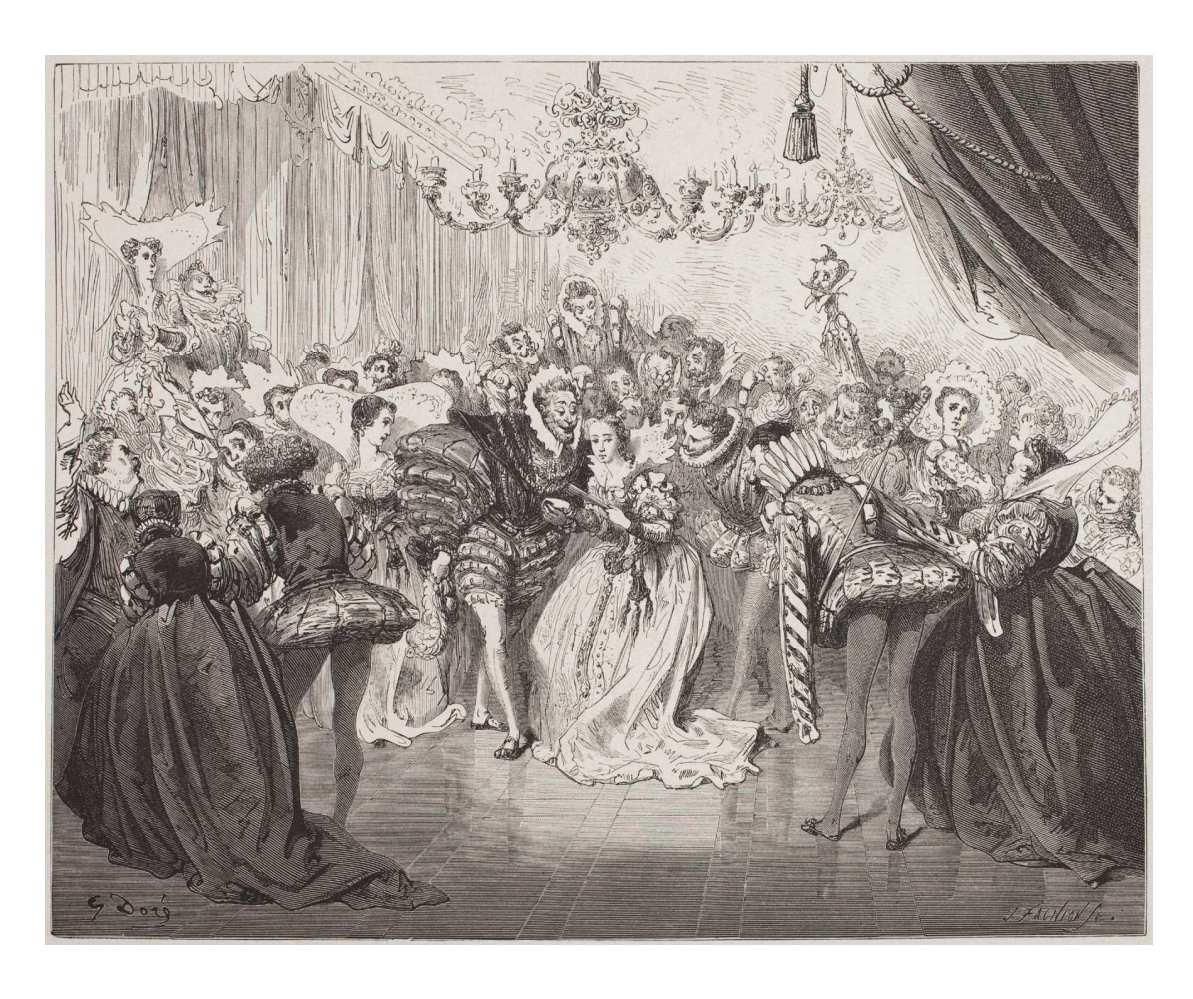
Fig. 2. The ball;

Gustave Doré; in Charles Perrault, Les contes de Perrault , illustrated by Gustave Doré, introduction by P.-J. Stahl, Hetzel, Paris, 1862; University of Canterbury Library, Rare Books Collection.