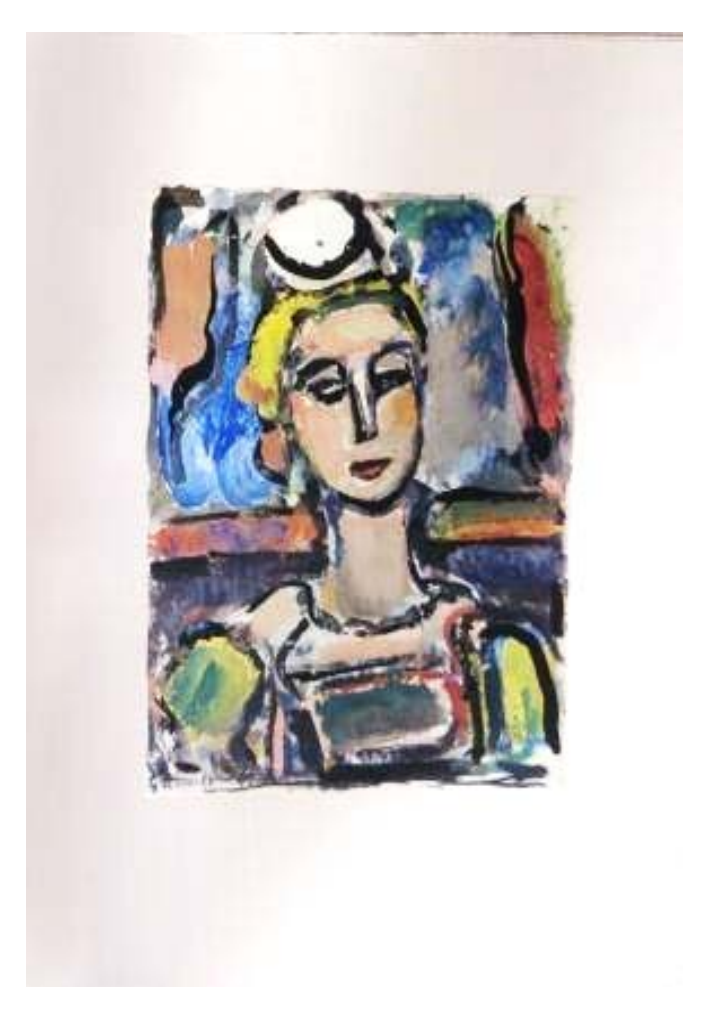
Fig. 3. Georges Rouault, "La Roussalka", in: Divertissement, Paris, Tériade, 1943, 65.

[And they say these good people that I am a painter of Death in love with Darkness With Deathly and Cold Night I abhor it]