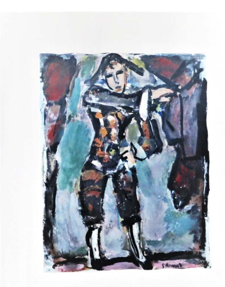
Fig. 5. Georges Rouault, "Harlequin", in: Divertissement , Paris, Tériade, 1943, 77. © Georges Rouault/ADAGP. Licensed by Viscopy, 2017.

The final image is the "Harlequin" [Fig. 5], a cultural resistance symbol of unity, no longer the youthful Jentie Bernard. Facing the Harlequin, written into the text is the word "Charlot", suggesting the circus like figure of Charlie Chaplin's tramp, a figure imbued with pathos. The text evokes the levelling power of death, "J'aime te voir une dernière fois [...] pour une danse macabre de hautbord" (75-76) [I like to see you one last time [...] For the supreme dance of death (Davenport 372)].