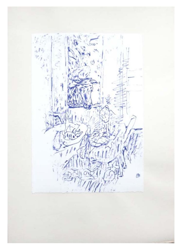
Fig. 9. Pierre Bonnard, Correspondances , Paris, Tériade, 1944, 9. © Pierre Bonnard/ADAGP. Licensed by Viscopy, 2017.

with each other, and under her chair is a dog scratching itself. The whole image generates a sense of peaceful domestic security.