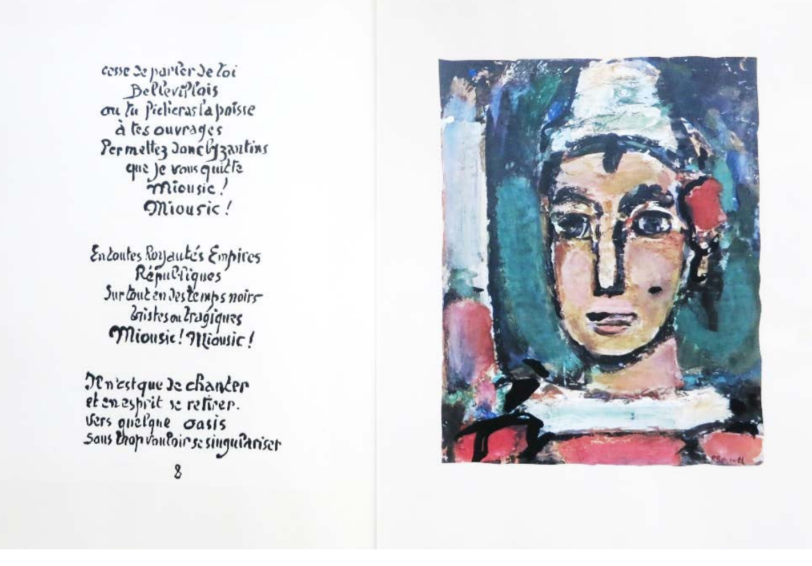
Fig. 1. Georges Rouault, "Jentie Bernard", in: Divertissement , Paris, Tériade, 1943, 9. © Georges Rouault/ADAGP. Licensed by Viscopy, 2017.

On the following page is the opening image of a dejected-looking young boy which is a portrayal of the artist, that Rouault named "Jentie Bernard" [Fig. 1]. The young boy is adorned with the patriotic red, white and blue colours. Emphasising the difficult time that the French were facing, Rouault wrote in the text the poignant question that many of those Parisians who had fled their capital were asking, "Le feu est-il à ta maison? / et Paris ne serait-il plus ton village?" (14) [Is your house on fire? / Is Paris no longer your hometown? (Davenport, 367)].