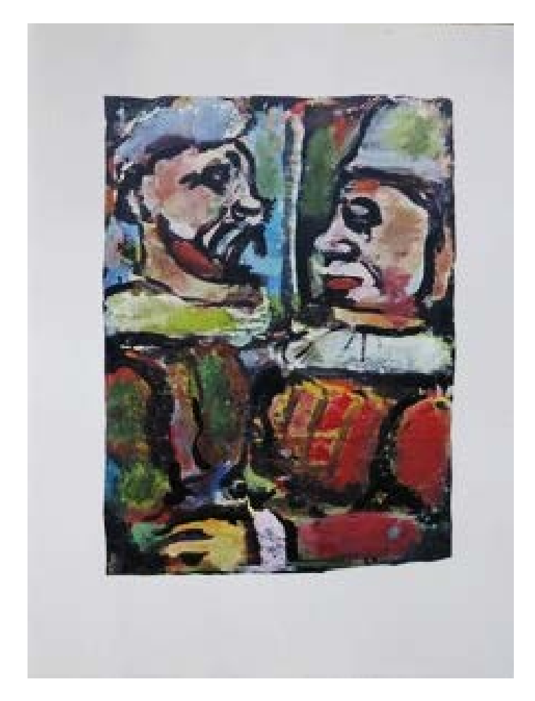
Fig. 2. Georges Rouault, "Les Deux Têtus", in: Divertissement, Paris, Tériade, 1943, 23.