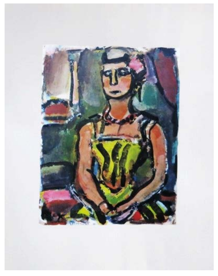
Fig. 4. Georges Rouault, "Madame Yxe", in: Divertissement, Paris, Tériade, 1943, 45.